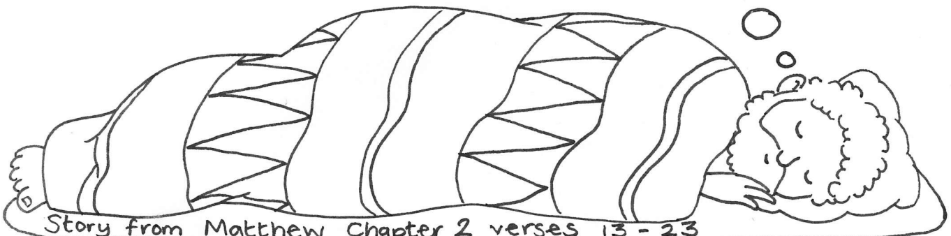
Story from Matthew Chapter 2 verses 13 - 23